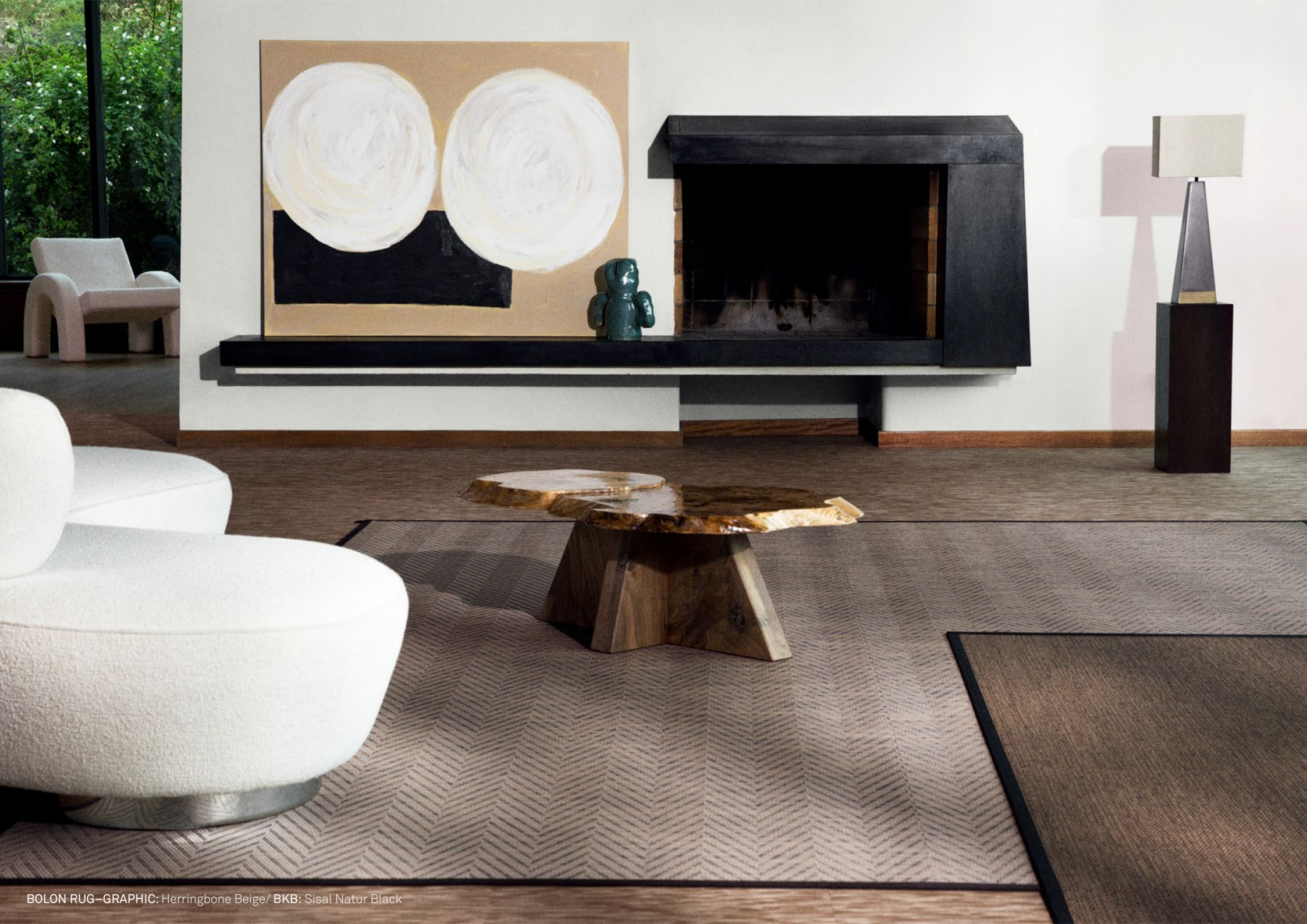
BOLON RUG—GRAPHIC: Herringbone Beige/ BKB: Sisal Natur Black