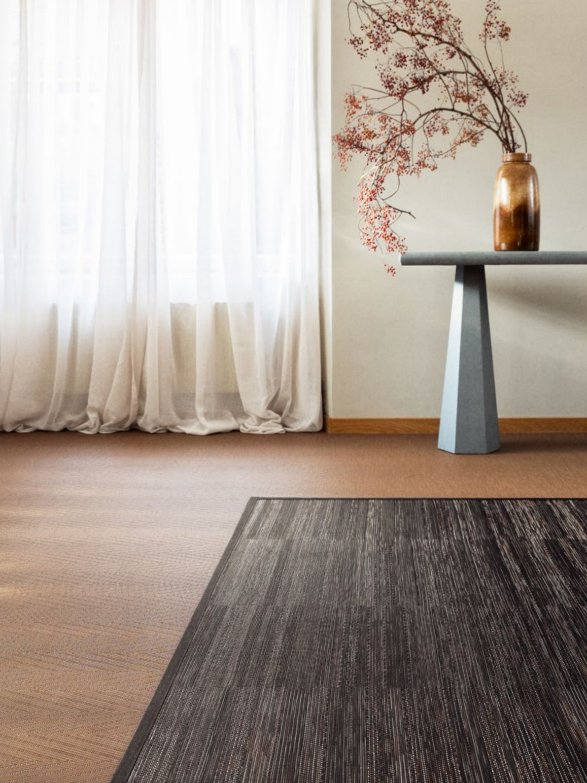
BOLON RUG— GRAPHIC: Gradient Brown